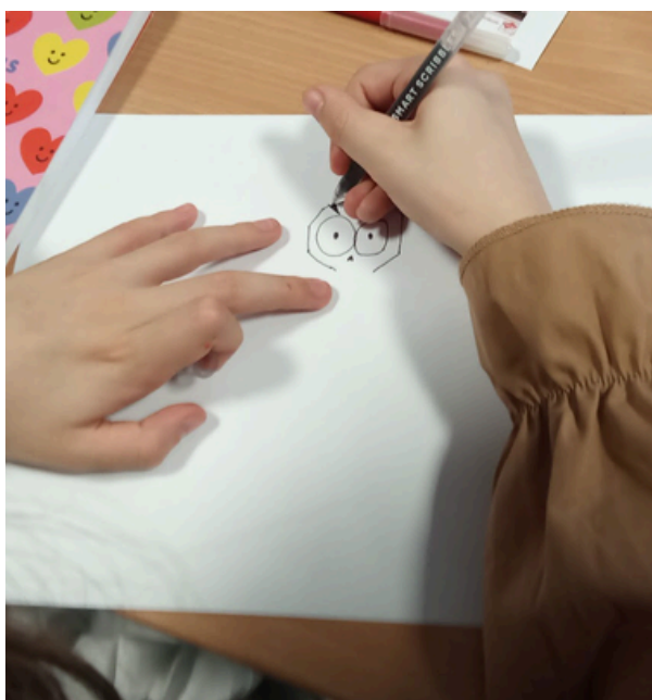
Photo: Imagination flowed as pupils created their own versions of the story's characters.

It was inspiring to see so many children speak so honestly and thoughtfully about their reading journeys.