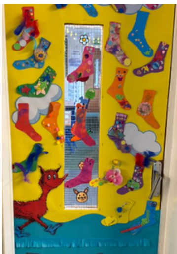
Photo: Every door opened the pages to a new adventure

Seeing families find a cosy corner in the classroom to share a story together was truly special. It was also wonderful to see siblings joining in together and enjoying books as a family. These quiet moments of reading together are such an important part of developing a lifelong love of books.