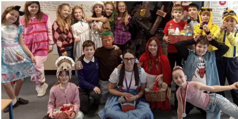
Photo: The creative costumes of Year 5.

One of the highlights of the day was seeing the amazing costumes worn by the children and staff. It was wonderful to see so many of our pupils transform into their favourite literary characters. From classic storybook heroes to modern favourites, the creativity and effort that went into the costumes was incredible.