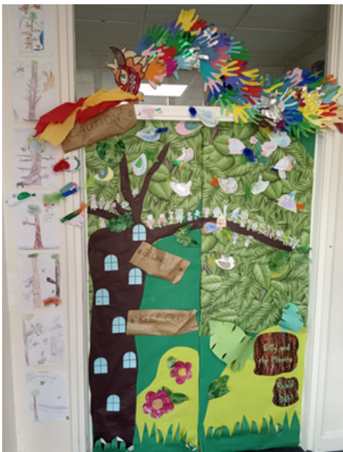
Photo: a wonderful showcase of imagination and favourite stories.