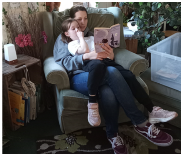
Photo: Special moments shared through stories.

Very soon we will also launch our Buddy Reading Café, where children across the school will come together to read and share stories with one another.