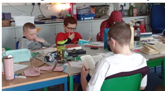
Photo: Perfect day to get lost in a good story.

From author visits and competitions to quiet reading moments and imaginative costumes, the entire school community came together to celebrate literacy.