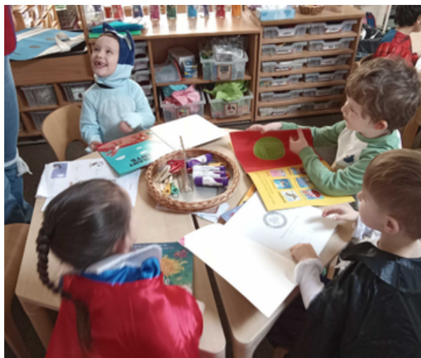
Photo: DEAR- the whole school pausing to enjoy a good book