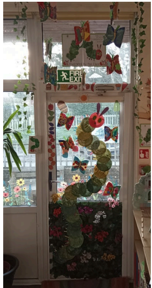
Photo: The Hungry caterpillar has enjoyed his time in EYFS