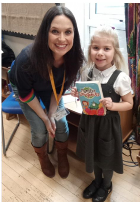
Photo: Inspiration in action- learning how stories are created.

Books appeared everywhere! Children found cosy spots around the school to enjoy a good story, and teachers joined in too, sharing their favourite books and modelling their own love of reading.