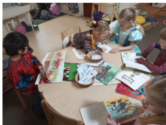
Photo: EYFS enjoyed sharing a good story

She shared her charming story “Humphrey the Hedgehog”, which explores the importance of being ourselves and choosing happiness. The children loved listening to the story and meeting a real-life author from our own school community.